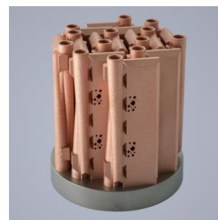
Sample parts printed with pure copper, like inductors, heat exchangers and electronics